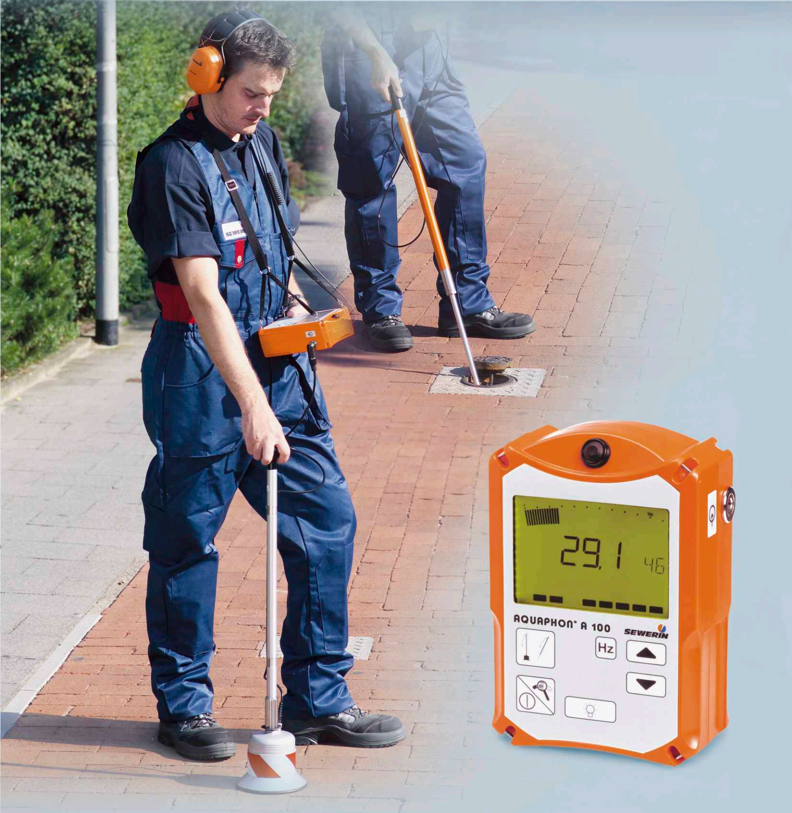
Receiver AQUAPHON® A 100 Electro-acoustic water leak detection